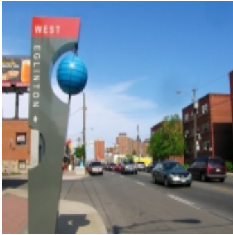
Eglinton West Village