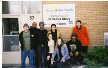
Staff and graduates from Career Horizons first group of participants March 2008

Since the establishment of Horizons for Youth in 1994, we have consistently provided a high standard of service to youth who traditionally have been economically marginalized and socially isolated.