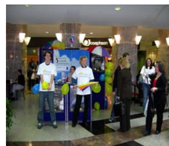
Umbrella Day Event Sponsor GGOF pictured above at their volunteer booth helping Horizons for Youth on April 13, 2007