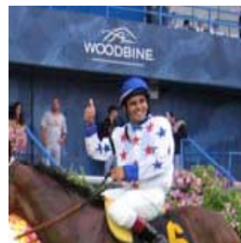
July 2007 at Woodbine Racetrack. A fun evening of dinner and racing in support of Horizons programs.

ers were brought to you by Deloitte, our Speaker's Table Sponsor. Thanks to Scotiabank Group, our Race Sponsors. Guests had the opportunity to take part in the excitement of watching the thoroughbred horses thunder by. We also cannot forget the event supporters, Cassels Brock & Blackwell LLP, Price-waterhouse Coopers, and Kodak Canada. All of these corporations helped make sure our 1st Annual Racing for a Reason Dinner was a huge success.